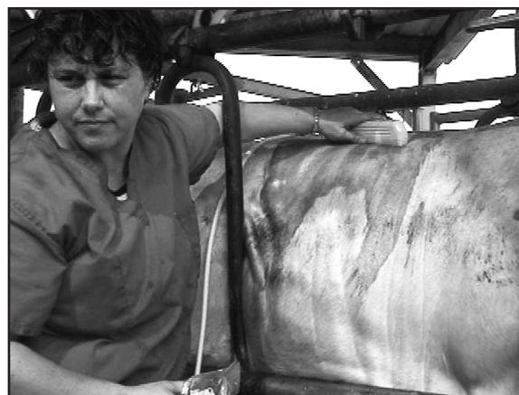
Figure 4. Ultrasound scanning a yearling bull.

It may be advantageous for several producers in an area interested in having their bulls scanned to arrange for a technician to service multiple farms in one area in one trip. The Mississippi Beef Cattle Improvement